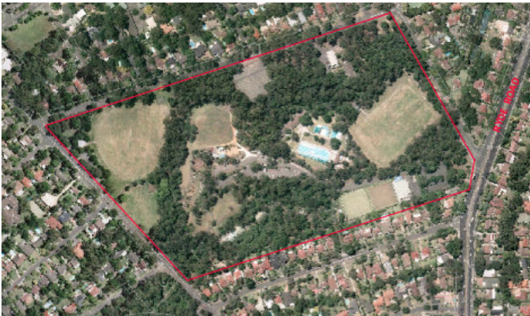
Figure 1 Aerial view of Bicentennial Park (source – Dept Lands SIX Viewer).

Two tributaries of Quarry Creek drain through the site, one aligned north-south in the western part of the site, and one aligned approximately east-west, in the southern part of the site.