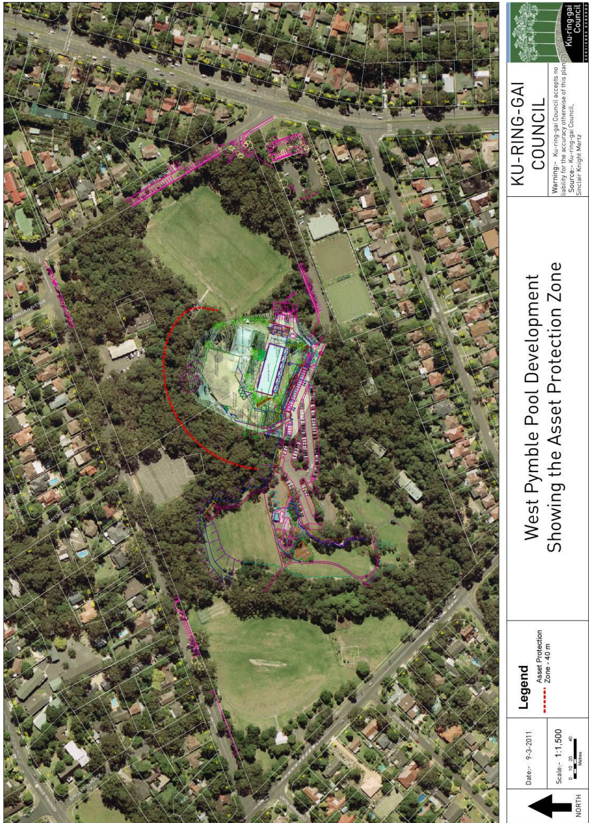
Figure 3 Aerial view of Bicentennial Park, showing the proposed development, including additional carparking.